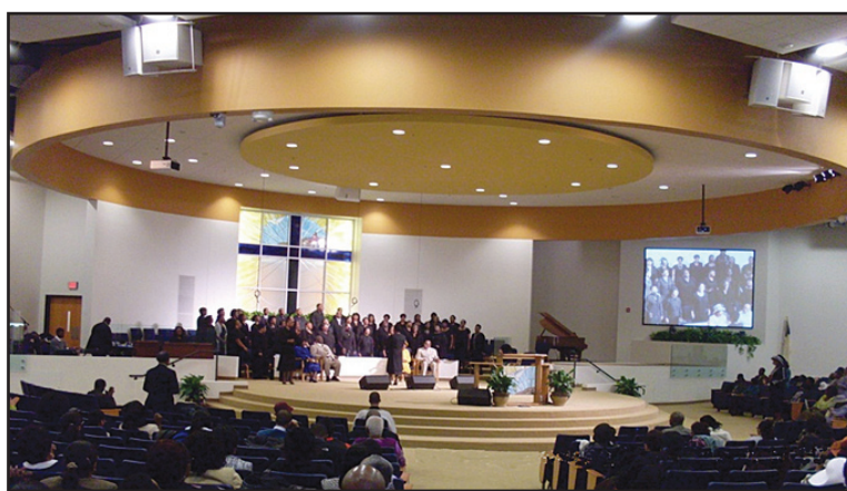
Rehobeth Church of God, Bloomfield, Conn.

of our business is home grown," he said, "and having a thorough understanding of state and federal permitting processes is one of our strengths."