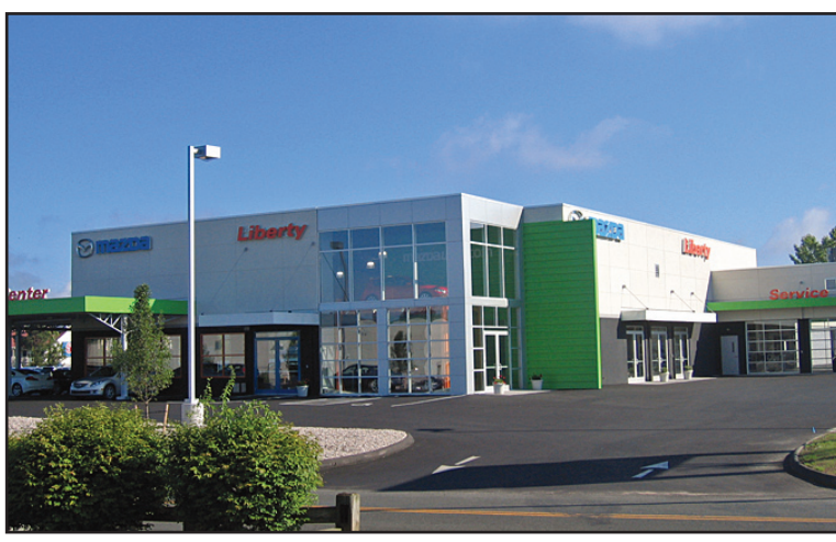
Liberty Mazda, Hartford, Conn.