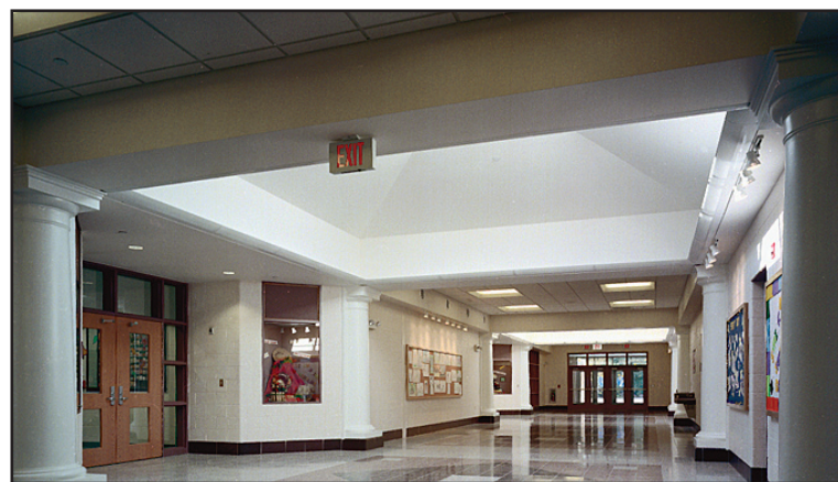
Avon Elementary School