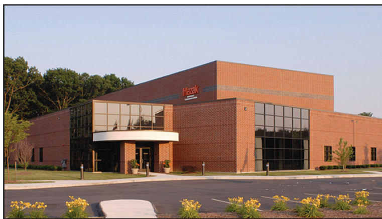
Mazak, Windsor Locks, Conn.