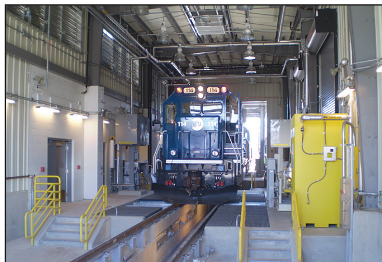
New Haven Rail Yard