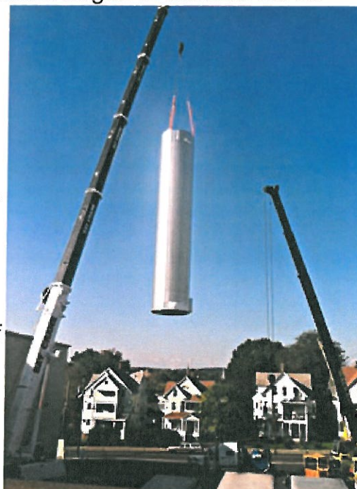
Cranes recently hoisted into place a 55,000-gallon stainless steel silo for storing raw milk at Guida's Milk & Ice Cream's newly expanded New Britain dairy plant.

In 1999, the dairy added a large state-of-the-art cooler, pasteurizing room and laboratory.